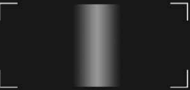
Spectrum of solitude to community