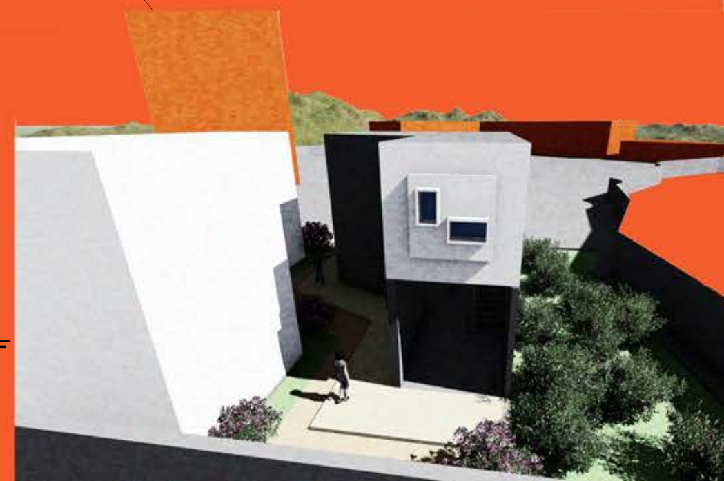
VIEW FROM THE ENTRANCE OF THE LIBRARY. SHOWING THE EFFECT OF PLACEMENT OF UNITS THROUGH SHADOWS.