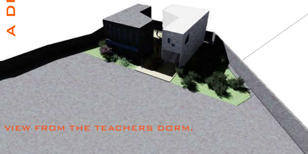
VIEW FROM THE TEACHERS DORM.