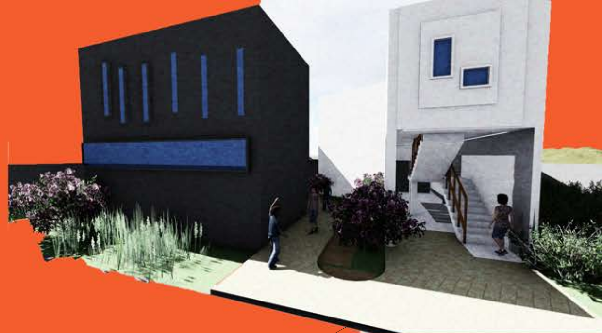
VIEW WHILE ENTERING THE CANTEEN THROUGH THE CORRIDOR.