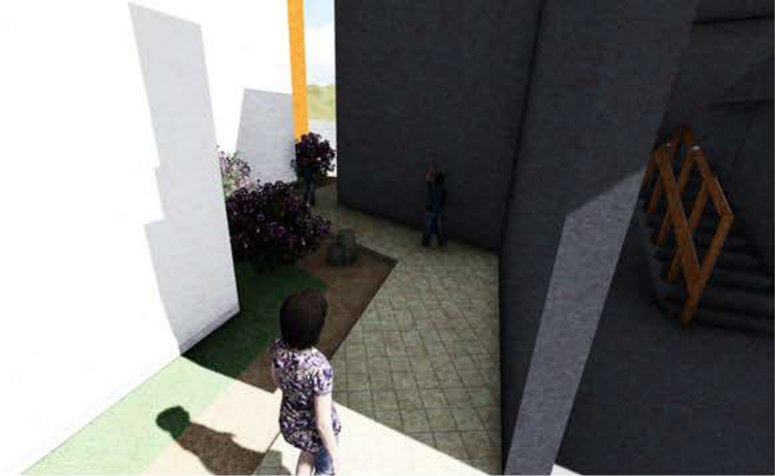
VIEW FROM THE CENTRAL PATHWAY