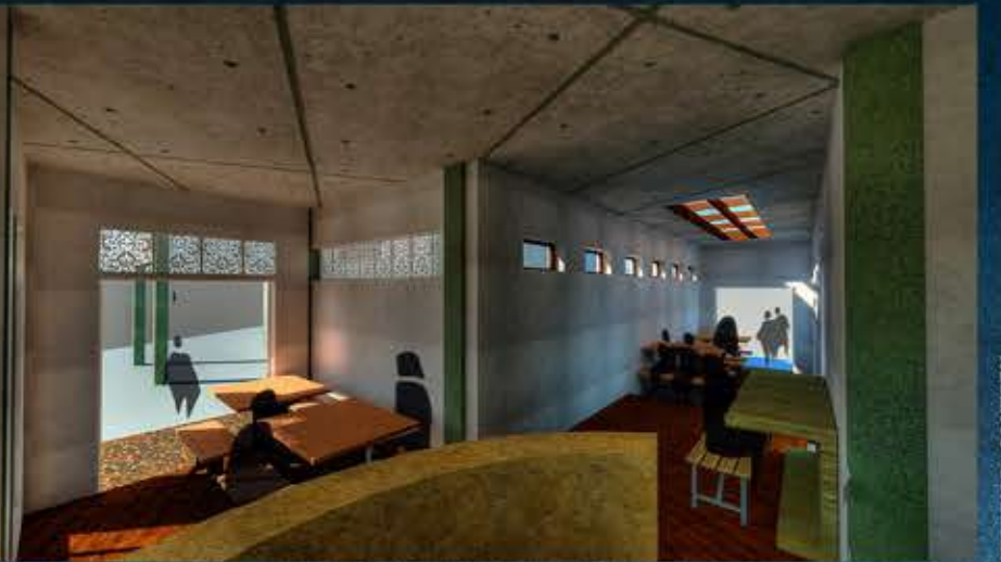
INTERIOR - CANTEEN