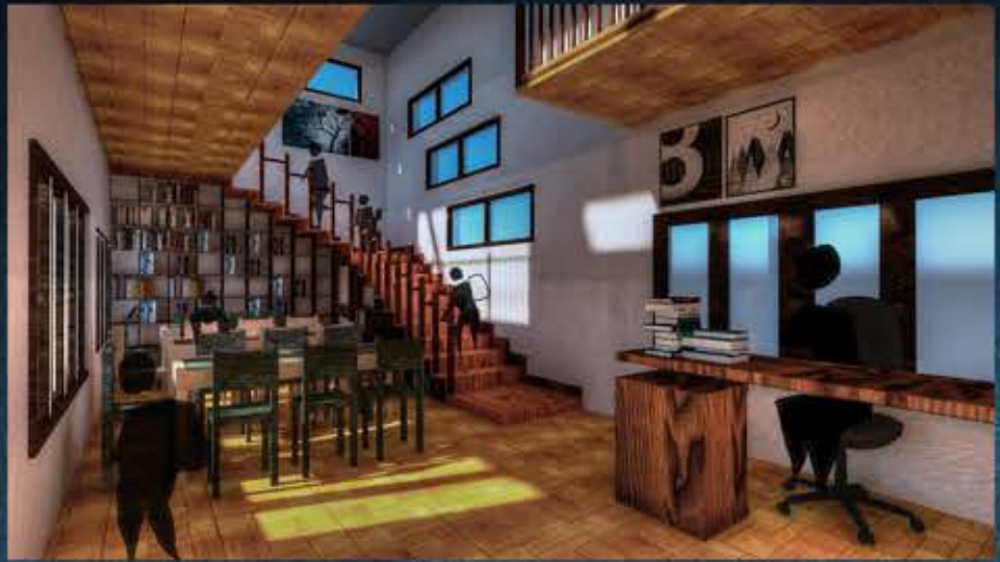
INTERIOR - LIBRARY

INSPIRED FROM BUYI THE MEZZANINE IS RAISED ON CONCRETE COLUMNS LIKE THE WOODEN STILTS OF BUYI HOUSES. THE LIBRARY HAS STAIRCASES THAT GOES UP TO THE MEZZANINE AND THE SPACE BELOW IT DOUBLES UP AS A BOOK SHELF. THE LIBRARY IS EXPLICITLY DONE IN THE SIMPLE WHITEWASH END BUT THE FLOORING IS WOD WHICH IS READILY AVAILABLE.