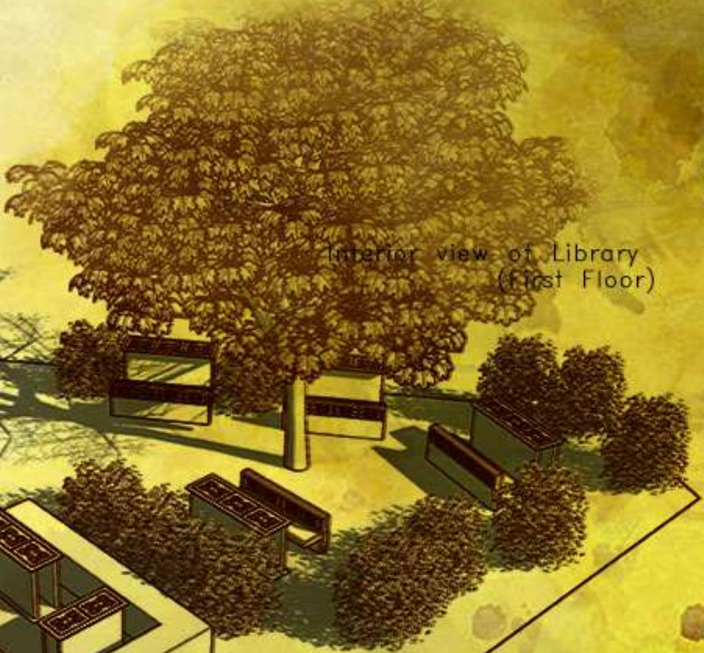
Interior view of Library (First Floor)