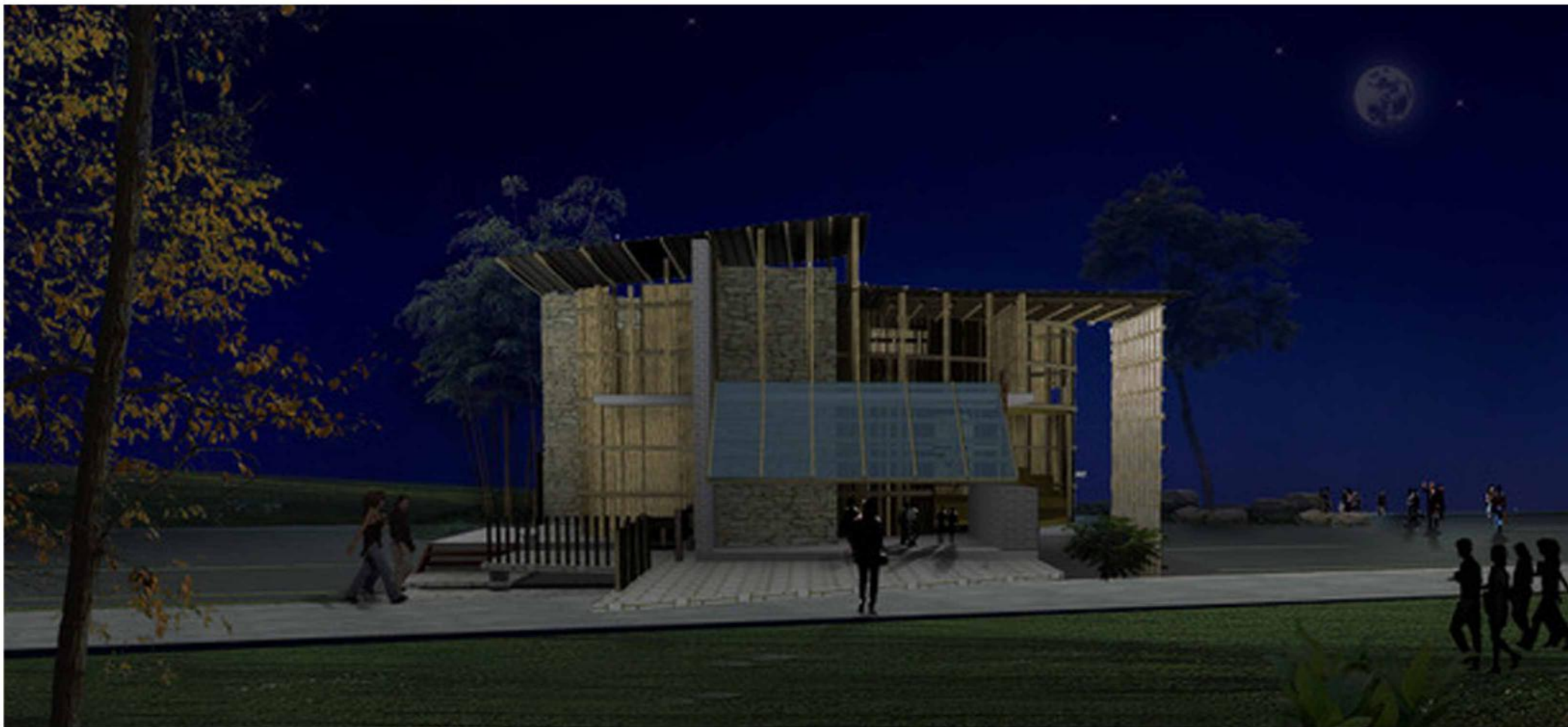
The twiddle project