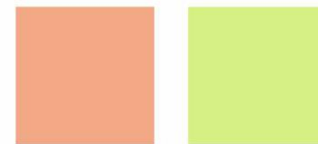
two different functions