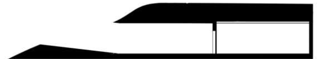
SECTION IN A SLOPED SITE