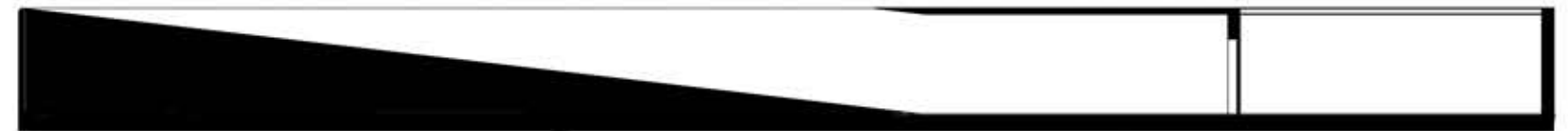
SECTION IN A FLAT SITE