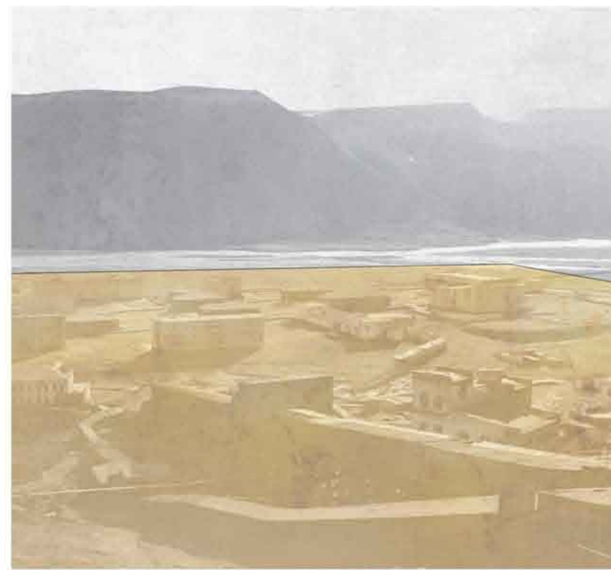
IMG 02 aerial view in detail of Pyramiden.