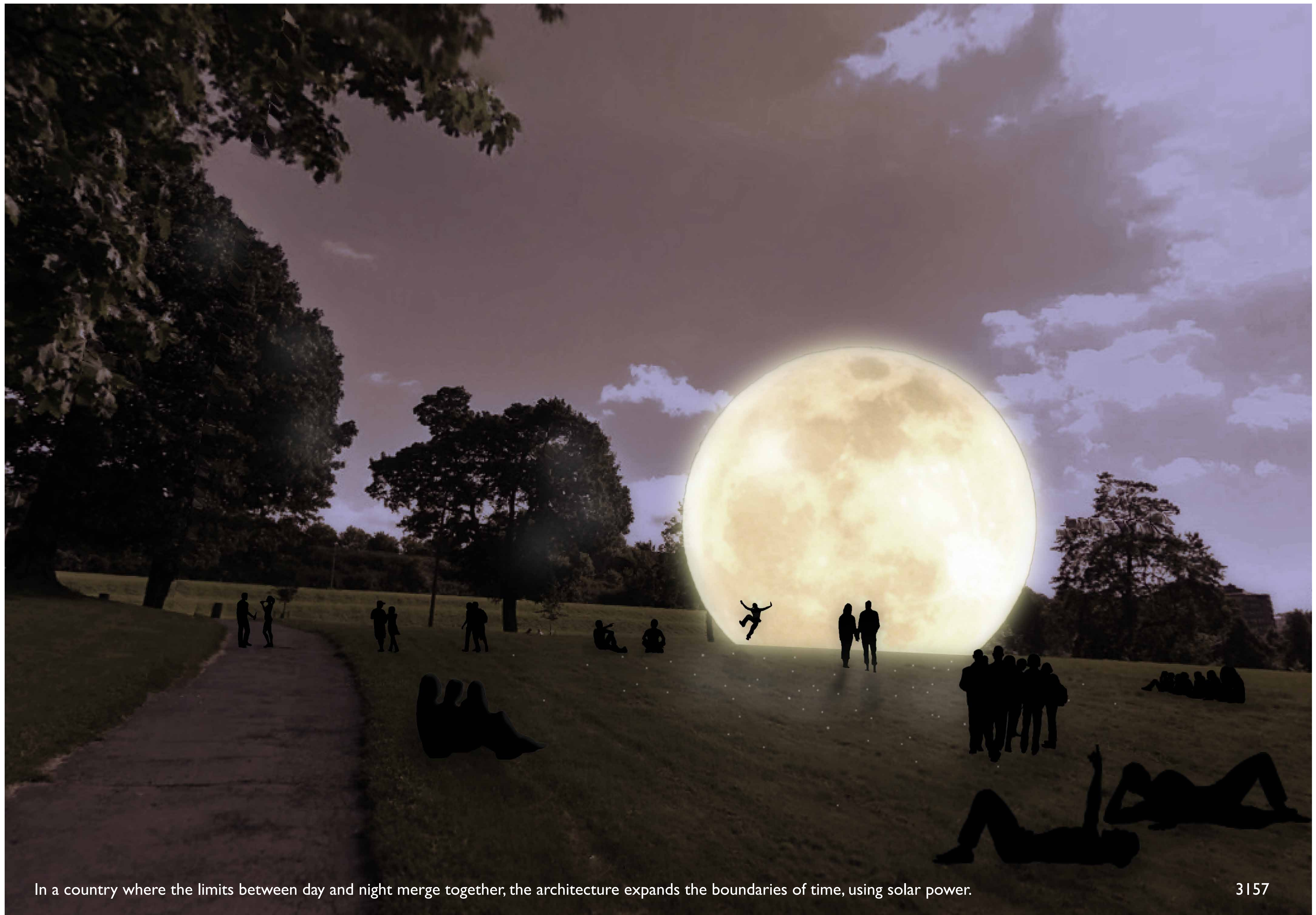
In a country where the limits between day and night merge together, the architecture expands the boundaries of time, using solar power.